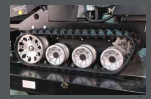
Industrial Grade Track System