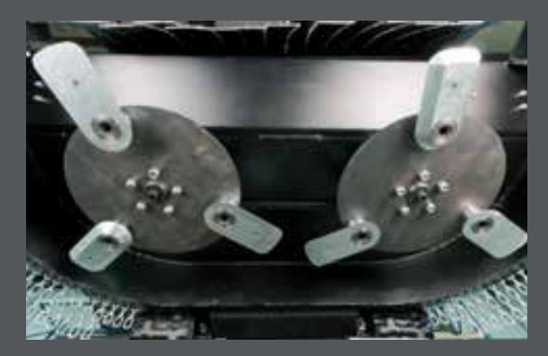
Massive Cutting Blades